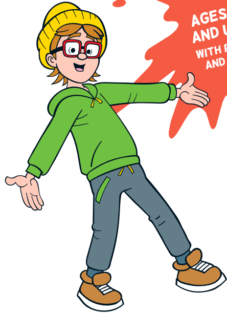
Beano

Thursday 26 July, 10.30am to 12.30pm Thursday 2 August, 10.30am to 12.30pm Thursday 9 August, 10.30am to 12.30pm Thursday 16 August, 10.30am to 12.30pm Thursday 23 August, 10.30am to 12.30pm Thursday 30 August, 10.30am to 12.30pm