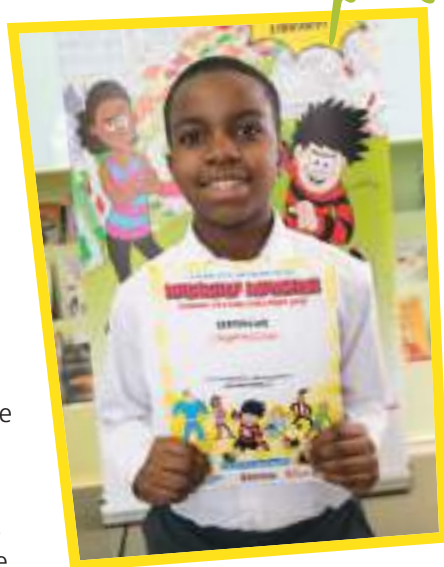
with thanks to Idea Store Watney Market

You must be a member of Southwark libraries to take part in the Summer Reading Challenge. Visit your local library and join up or join online at www.southwark.gov.uk/libraries/membership