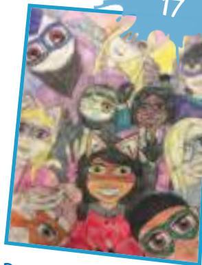
Drawn by Brook, winner of the graphic art competition 2017 (ages 14 to 17)